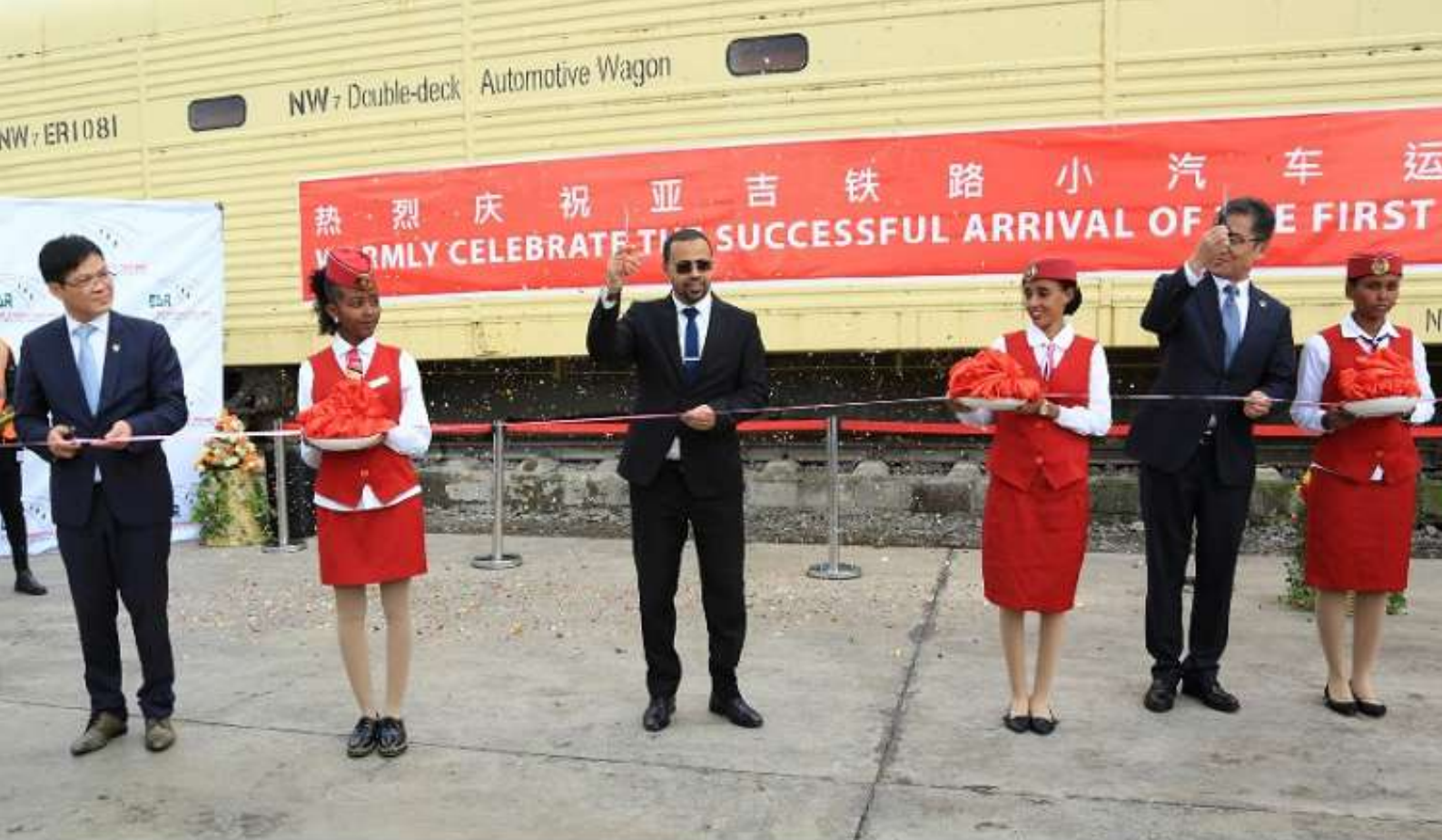
Ethio-Djibouti Railway built by China BRI, launched in Addis Ababa, August 25, 2022