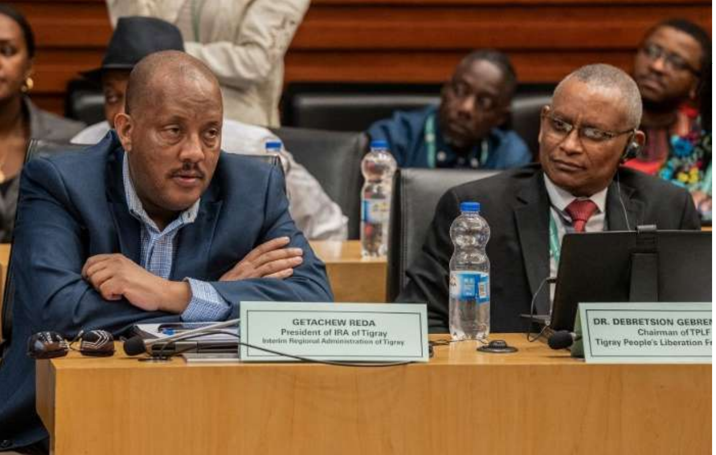
Tigray leaders are torn between Addis Ababa and Asmara. TIA president Getachew Reda (l.) and TPLF president Debretsion Gebremichael (r.) in Addis Ababa, Ethiopia, February 16, 2025

losses, and considerable opportunity costs for both nations. Eritrea was initially confederated with Ethiopia, but its unilateral incorporation triggered widespread resistance among Eritreans. King Haile Selassie revoked Eritrea's right to self-determination, which had been guaranteed under the 1952 Federation Agreement (United Nations General Assembly Resolution 390(V), 1952). After three decades of armed struggle, Eritrea held a UN-supervised referendum in 1993, in which the population overwhelmingly supported independence (United Nations Mission to Eritrea and Ethiopia, 1993).