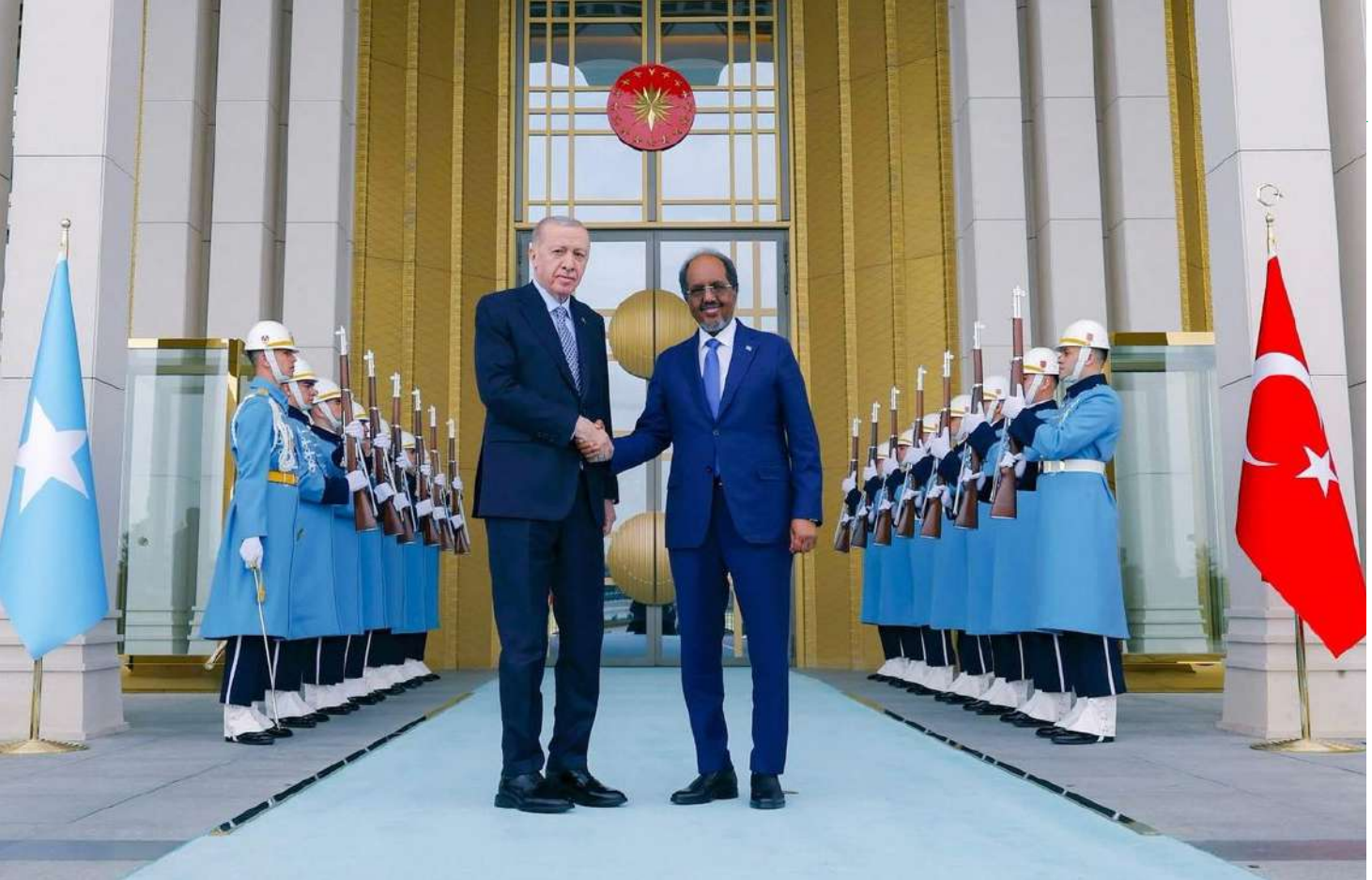
Somali President Hassan Sheikh Mohamud and Turkish President Tayyip Erdoğan in Ankara, Turkey, hold talks to accelerate joint initiatives in infrastructure, trade, security, and humanitarian aid on March 28, 2025

Foreign actors—whether the Gulf countries or Turkey—have all begun their engagement in Somalia through soft power, capitalizing on historical and religious ties to gain influence. Over time, however, their roles have evolved, and their involvement is no longer purely economic or humanitarian. The Gulf crisis underscored just how powerful these actors have become in Somalia, revealing their ability not only to invest in infrastructure and security but also to shape political allegiances and deepen divisions within the country. The UAE, for instance, leveraged its economic influence to back rival factions in Somali politics, while Turkey positioned itself as one of Mogadishu's strongest allies, securing military agreements and major infrastructure projects.