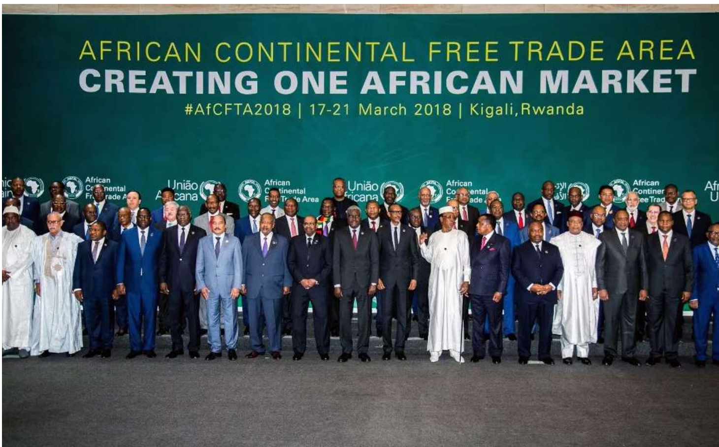
African heads of state and government at the African Union Summit that saw the signing of the African Continental Free Trade Agreement in Kigali, Rwanda, on March 21, 2018.

Simultaneously, reinforcing regional security through IGAD is crucial to reducing reliance on foreign military forces. This is long overdue. With Djibouti hosting U.S., Chinese, and French bases, the HoA remains vulnerable to external military competition and manipulation. A unified security framework, akin to the ECOWAS Standby Force, or a revised and strengthened Eastern Africa Standby Force (EASF) could enhance sovereignty without escalating regional tensions.