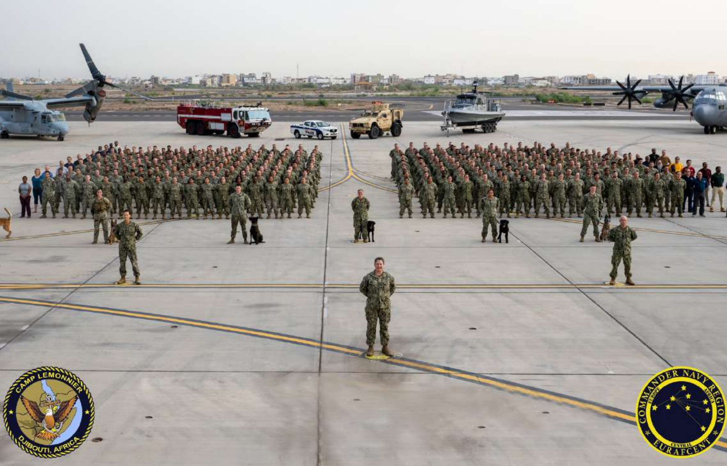
Camp Lemonnier a U.S. Navy installation and the only permanent U.S. military base in Africa

both opportunities and risks, reshaping the region's geopolitical landscape. HoA states must carefully navigate this shifting world order, balancing the promise of development with the imperative of preserving sovereignty. As Robert Kaplan observes in The Geography of Power , enduring influence is rooted in control over key geographical nodes, a reality that underscores the HoA's intrinsic importance (Kaplan, 2009).