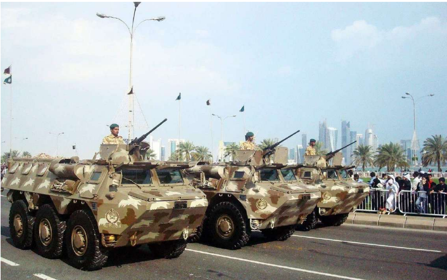
Qatar donated 68 armored vehicles to Somalia in 2019, cementing Doha's presence and influence in the country

Somalia's trade with Qatar remains highly asymmetrical. In 2023, Somalia exported $13.2M in livestock to Qatar, growing at 23.1% annually since 2018, while Qatar's exports to Somalia totaled just $143K, despite a higher growth rate of 45.7%. This suggests Somalia benefits more from the trade relationship (Observatory of Economic Complexity, 2023).