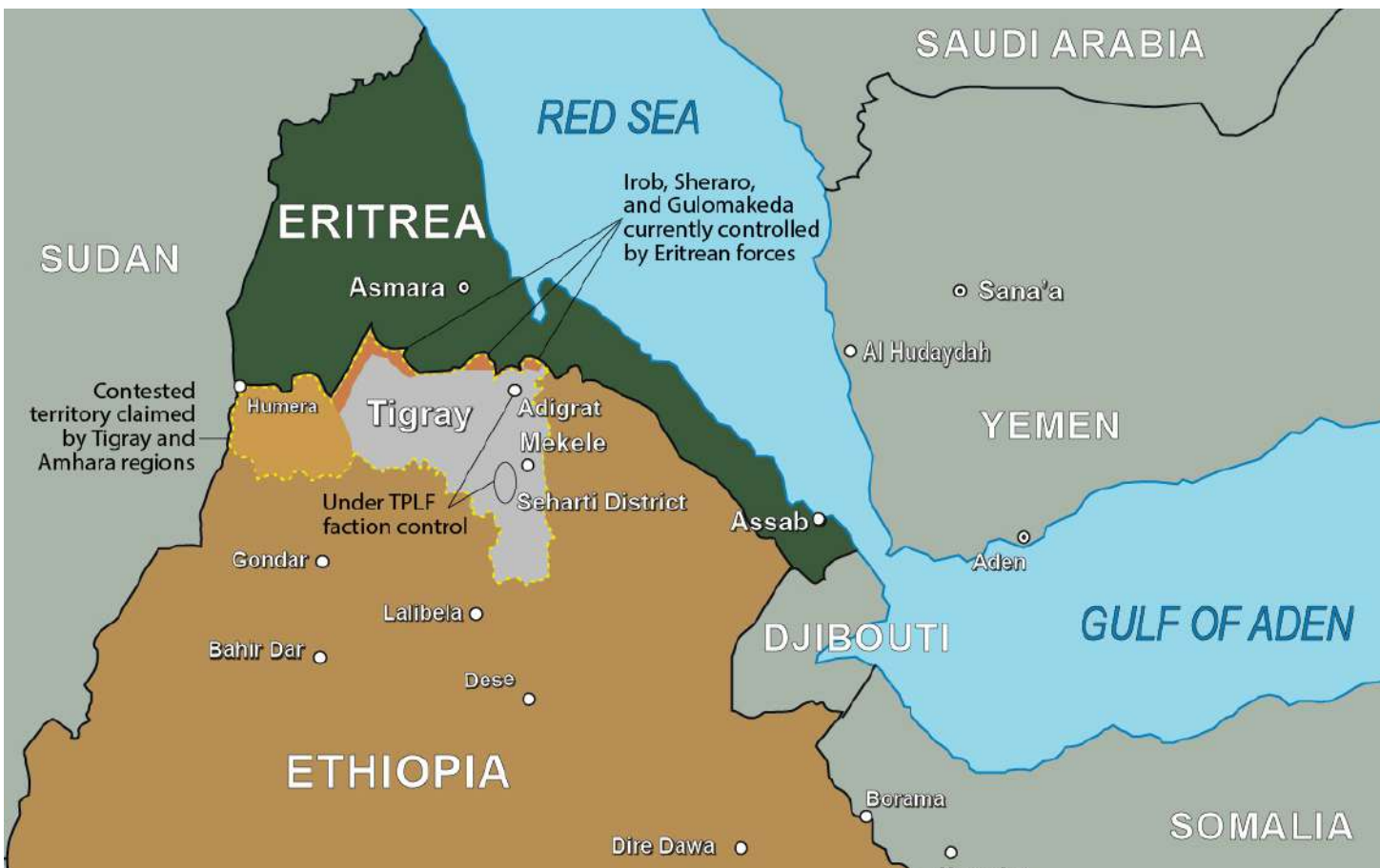
Ethiopia-Eritrea-Tigray map not-to-scale illustration of areas of control and influence