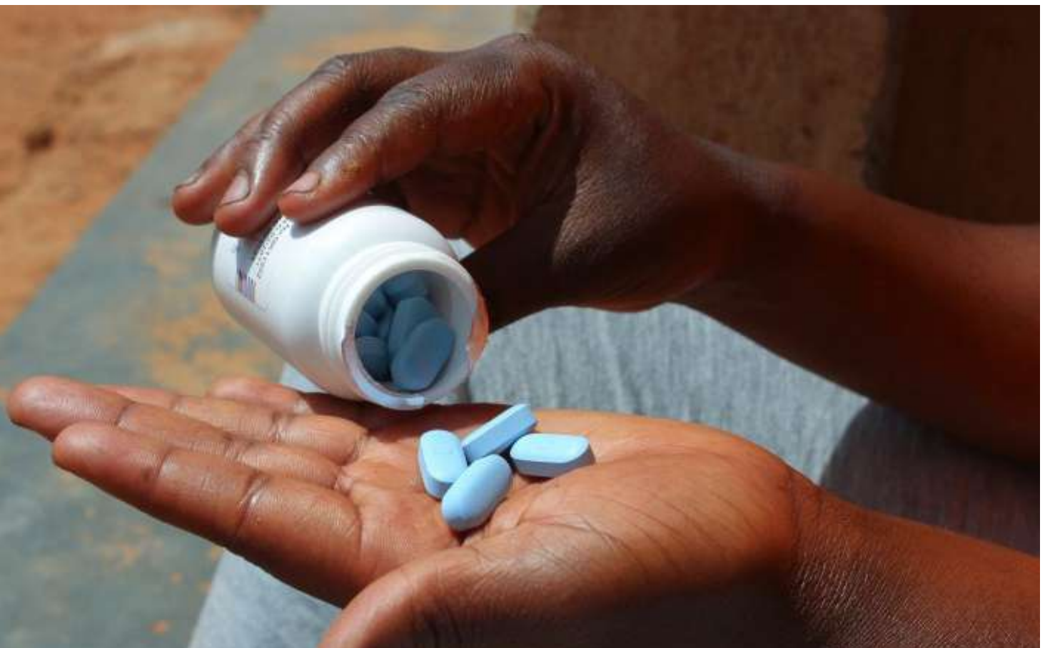
Hundreds of thousands living with HIV in Africa will be affected by the US executive order following the slash on HIV prevention medicines, largely funded by the USAID-PEPFAR