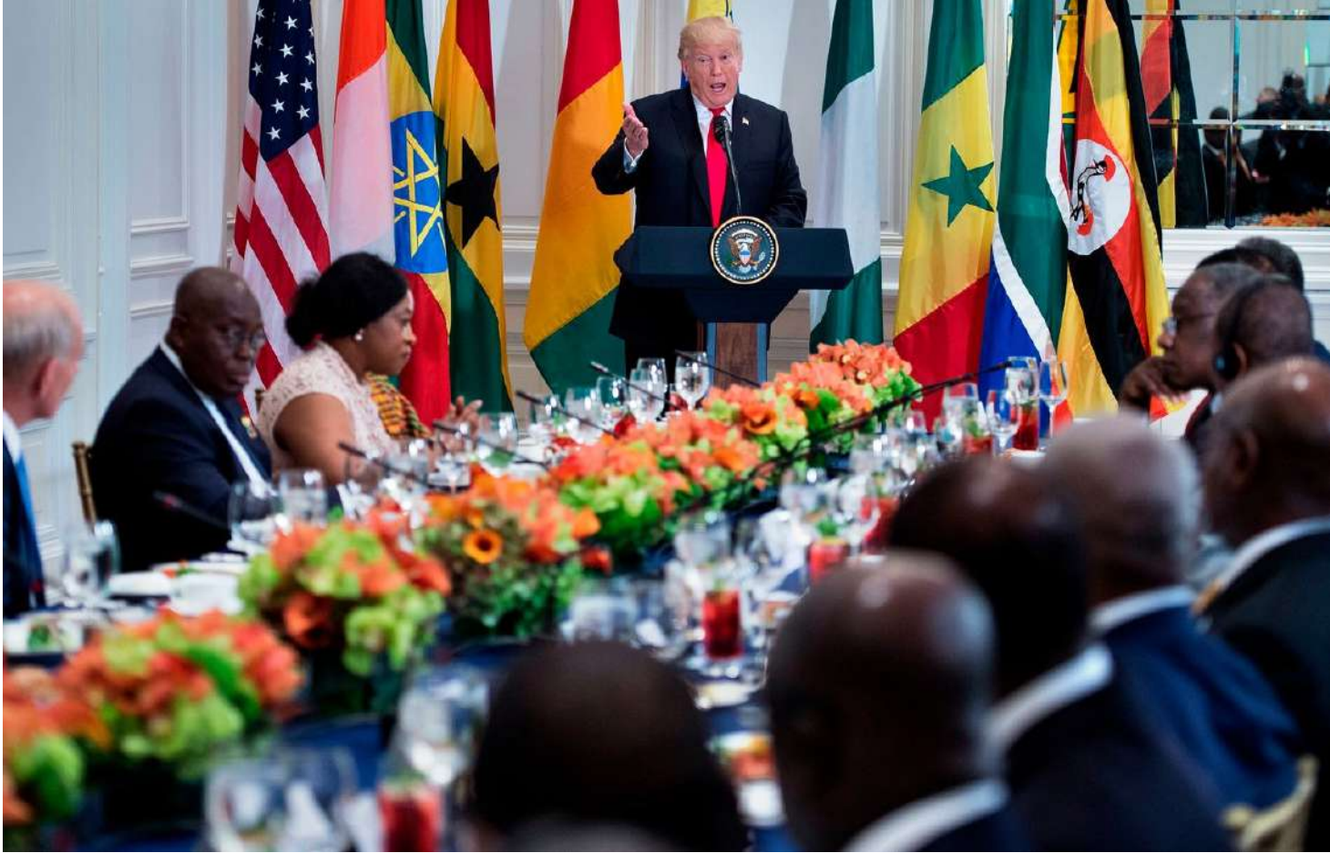
President Donald Trump proposed 10 per cent duty on most goods from the African Growth and Opportunity Act (AGOA) countries will significantly affect their economies.