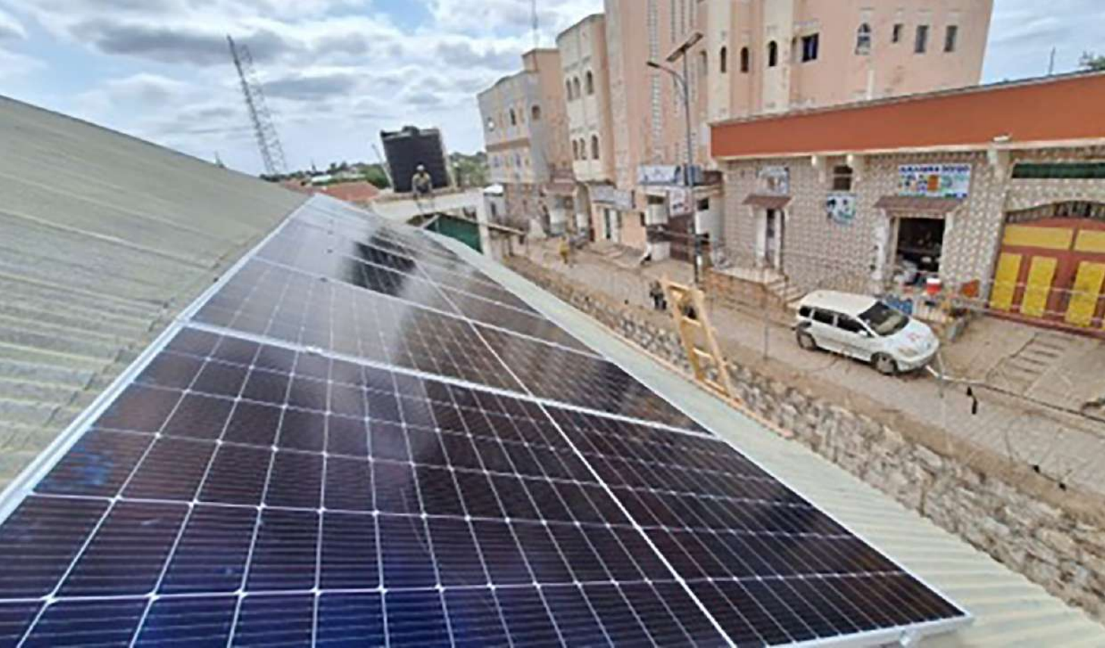
Saudi Arabia power Somali Health Centers with solar energy to combat child mortality in Somalia

As Somalia navigates these shifting geopolitical currents, the interplay between global crises and regional rivalries will continue to shape its future. This article will explore the historical role of foreign powers in Somalia, analyze the impact of recent port and military deals, and examine how shifting alliances among Gulf states, Turkey, and other external actors are shaping Somalia's political landscape. The evolving dynamics of the Israel-Gaza conflict, Gulf rivalries, and Turkey's expanding presence will determine the country's path toward stability—or further fragmentation—in the years ahead.